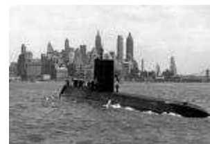
Atomic Nautilus Submarine