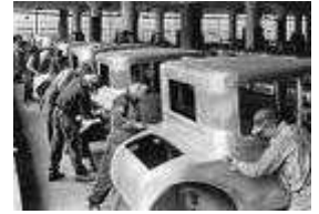
Henry Ford's Assembly Line