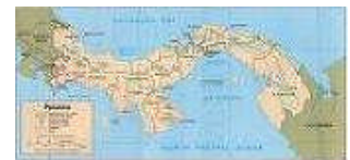
Map of Panama