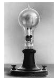
Thomas Edison's Electric Incandescent Lamp