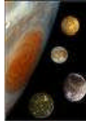
Four of Jupiter's Moons