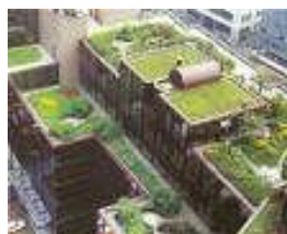
Vegetative Roof Systems