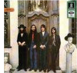
The Beatles US Hey Jude Album