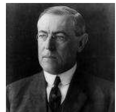
President Woodrow Wilson