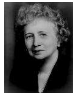
First Lady Bess Truman