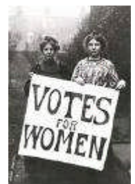
Women exercised right to vote