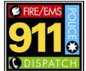
First 911 System