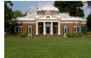
Thomas Jefferson's Monticello