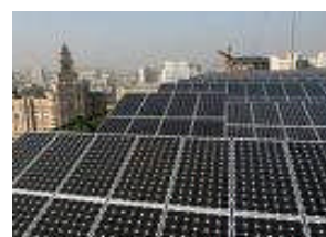
Photovoltaic Roof Systems