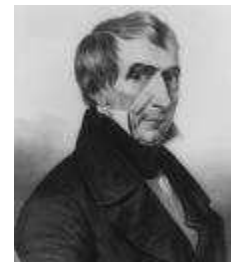
President William Henry Harrison