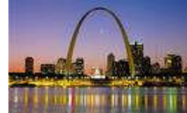
City of St. Louis