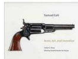
Samuel Colt's Revolver Patent