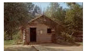
U.S. Post Office